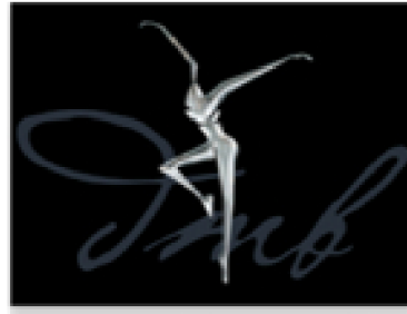
Dave Matthews Band, Stand Up