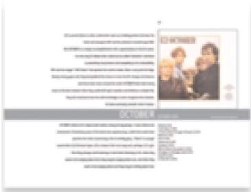
U2, The Complete U2